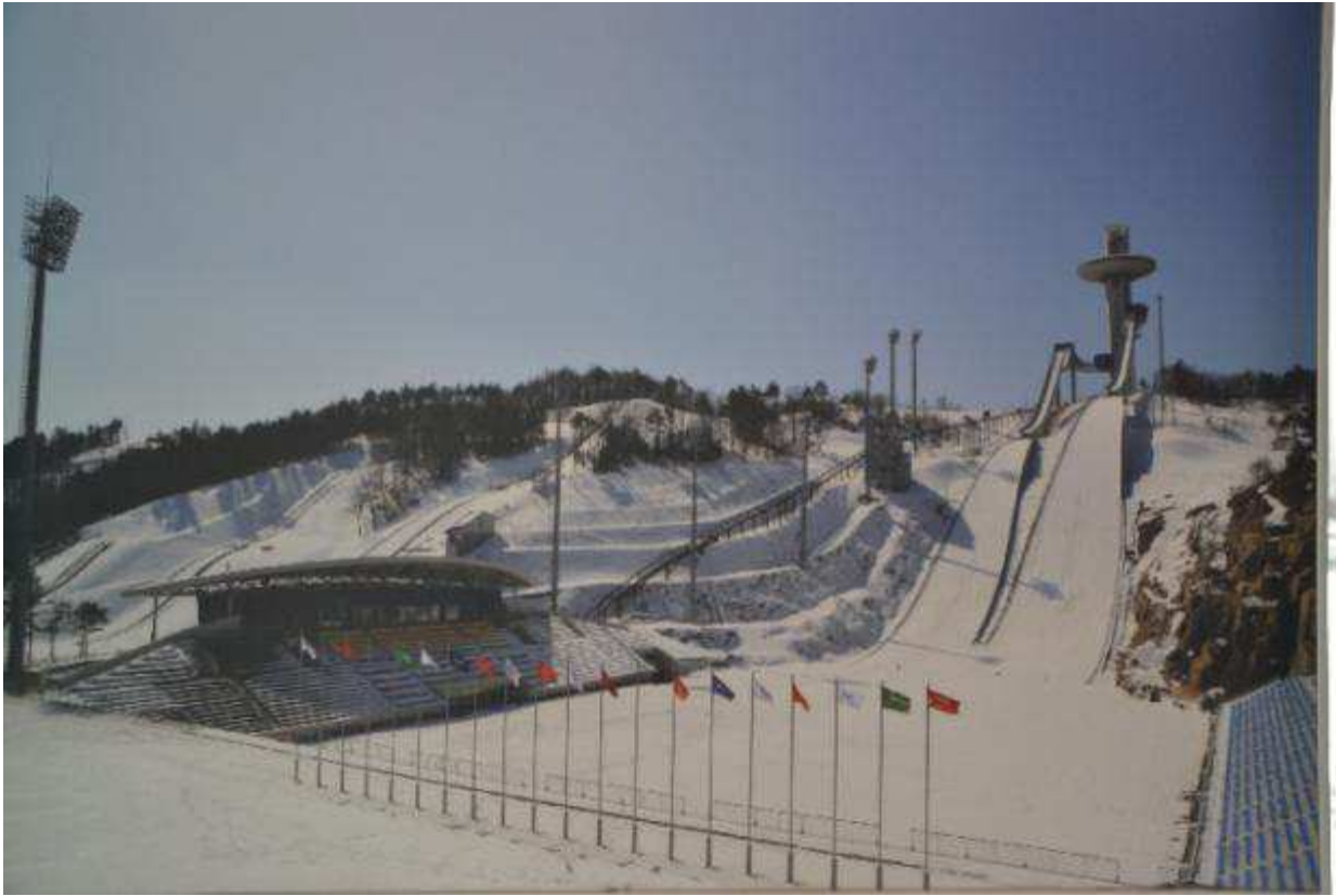
POLISH OLYMPIC CHAMPIONS