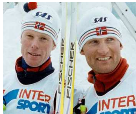
DÆHLIE and ULVANG

(Germany) – speed skating – two golds and one silver